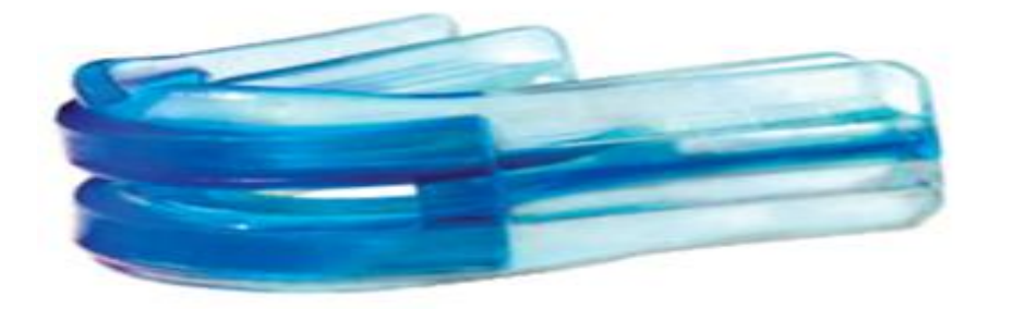
Boil and Bite Mouth guard (legal for upper and lower braces)