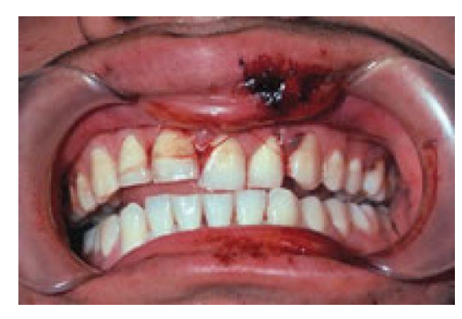
Do you think this athlete may also have signs of a concussion?